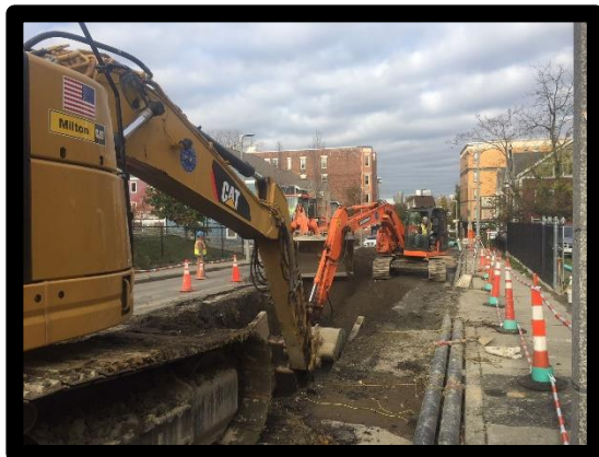
Dudley Street Excavation for 24" Sewer Installation

Construction Contacts: For additional information contact.