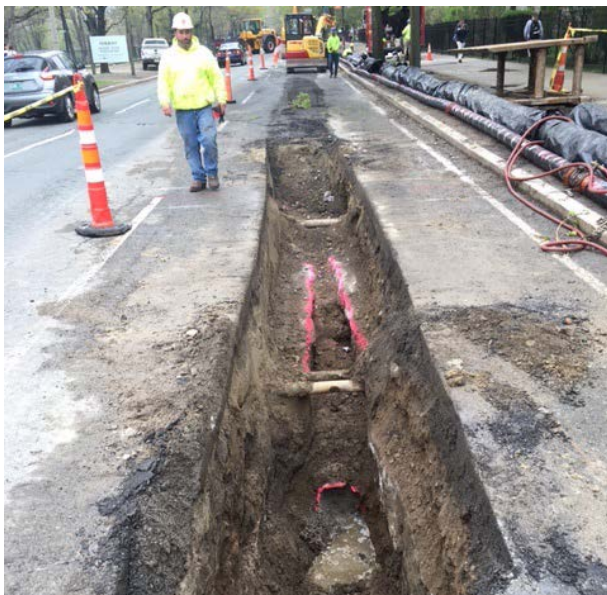
Replacement of Water Main