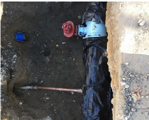
Water Service Connection