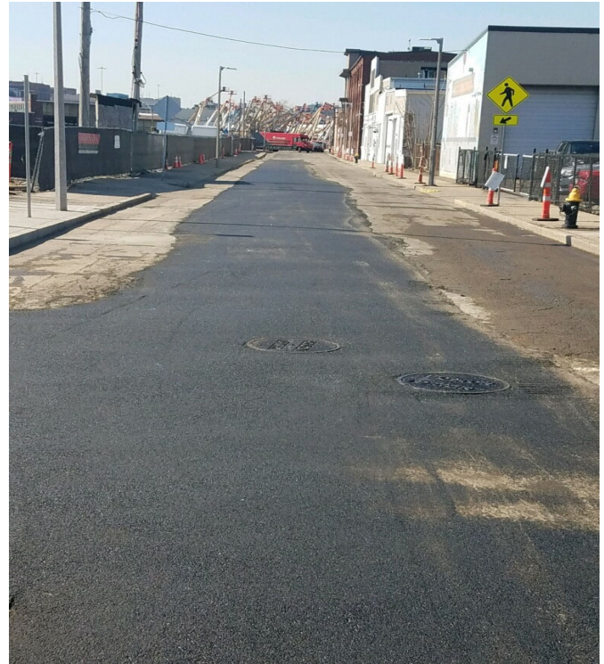
Temporary sewer and drain trench pavement on Damrell Street