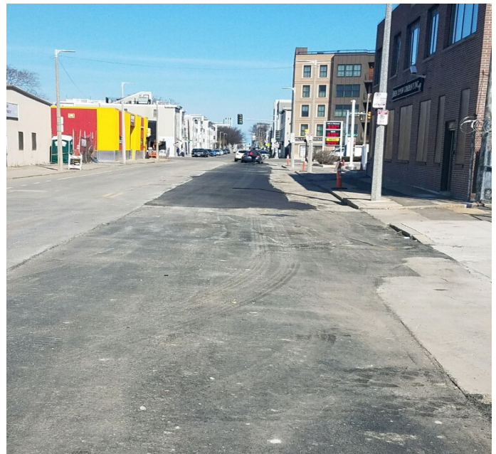
Temporary paved sewer trench on D Street from Dot Ave towards Old Colony Street.