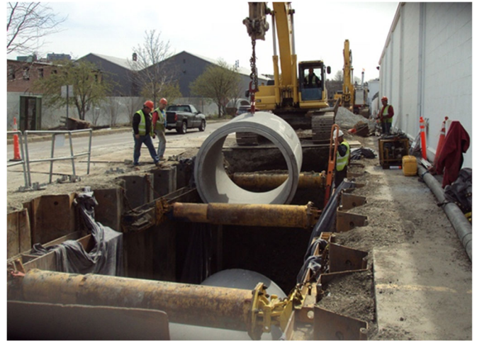
Figure 1: Installation of Storm Drains