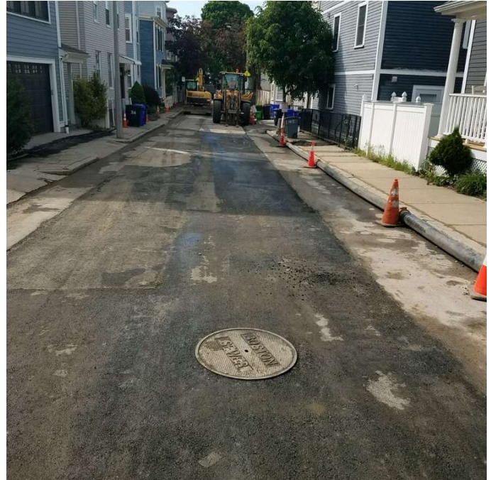
Temporary Paving on Middle Street

The South Boston Sewer Separation Project encompasses an area roughly delineated by Interstate 93 to the west, West Broadway, and West Second Street to the north and east, G Street to the east, and Devine Way to the south. Land use in the project area is characterized by residential neighborhoods; light industrial and large commercial buildings and complexes; small business and retail districts; civic, cultural, and educational facilities; and transportation-related sites.