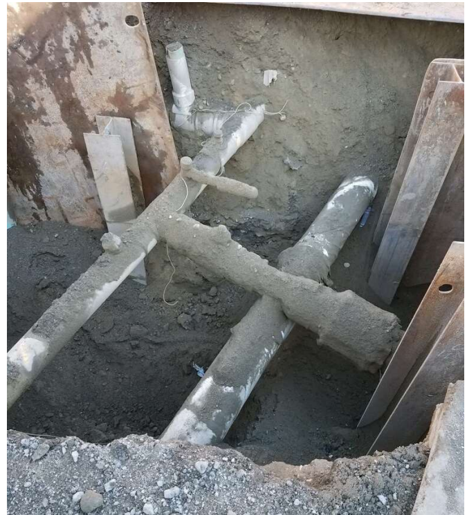
Trench on D Street at Old Colony Avenue

Incidents reported this period 0 Incidents reported to-date 0