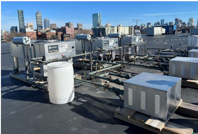
Removal and Replacement of Roof Top Units

The Commission has designed and bid the first phase of improvements to the HVAC system and the roof replacement at our Headquarters at 980 Harrison Avenue. The project entails upgrades to several structural beams within the ceiling on the third floor, replacement of the twelve (12) rooftop Air Handler Units, seven (7) Make-up Air Units and several exhaust fans. Construction cost is $21,188,886.00.