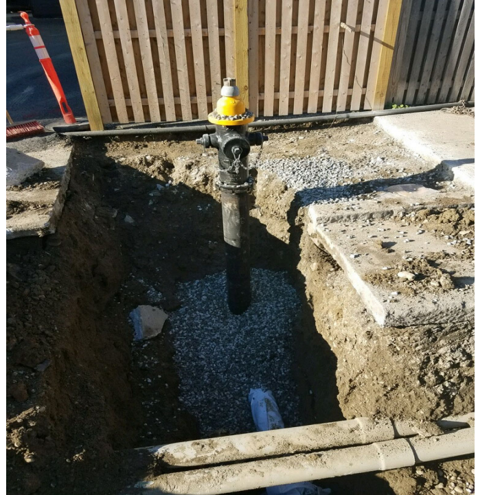
Hydrant installation on West Eighth Street

The contractor will install new watermain on West Eighth Street from D Street to the north section of West Eighth Street and connect to existing pipeline.