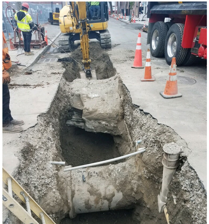
Trench Excavation for drain install on West Eighth Street